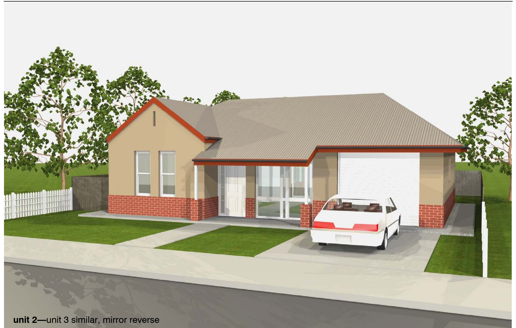
unit 2—unit 3 similar, mirror reverse